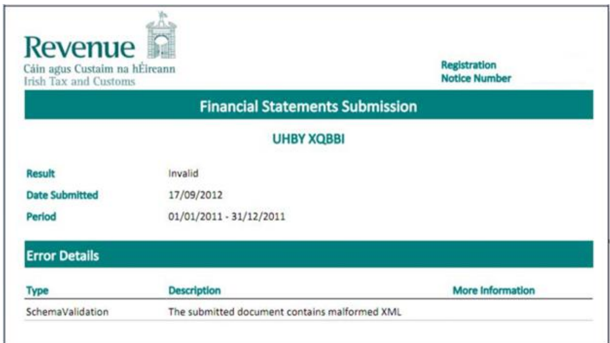
Figure 2-3 – Screenshot of the Financial Statements Validation Results Document

Individual errors will be listed detailing the error type and description. The possible error codes are set out in Table 2.4 and Table 2.5 below.