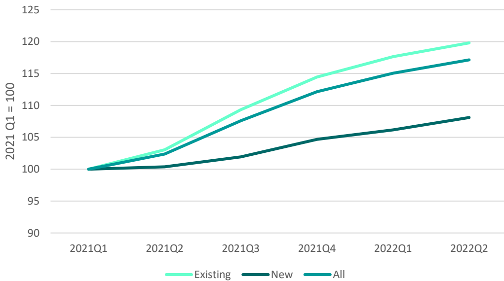
Figure 2 – RPPI for New, Existing and All Properties