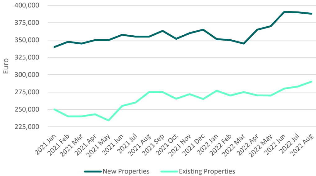
Figure 1: Median Sales Price of New and Existing Properties