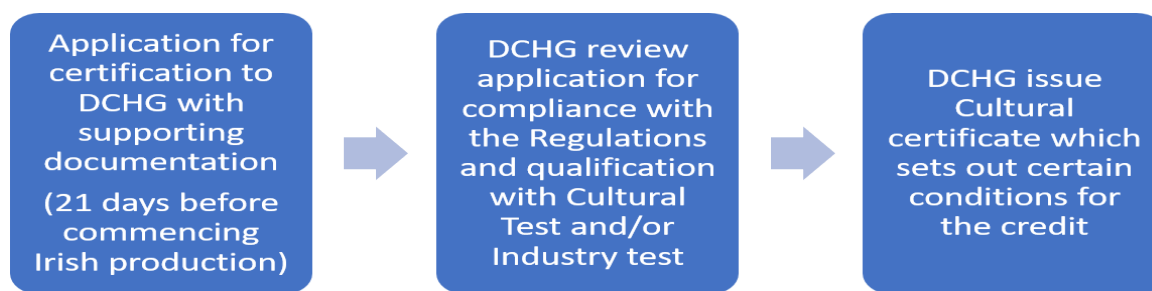
Figure 1: Film Certification Process