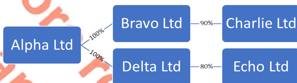
Diagram 3: Companies association test

However, if Charlie Ltd held 20% of the issued share capital of Echo Ltd, Alpha Ltd would indirectly hold 90% of the issued share capital of Echo Ltd (i.e. 80% indirectly through Delta Ltd and 18% (90% of 20%) indirectly through Charlie Ltd). In this case, transfers of property between all five companies could avail of the relief.