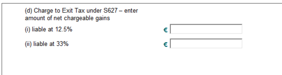
Figure 12: Updated question on Capital Gains (other than on land with Development Value)

This question has been re-labelled and split into two questions to capture the amount chargeable at 12.5% and 33% as shown below: