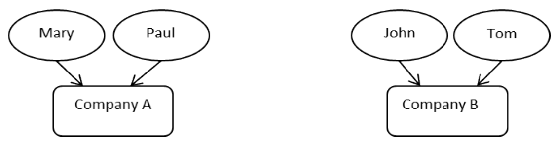
Figure 1: Before the share for share exchange